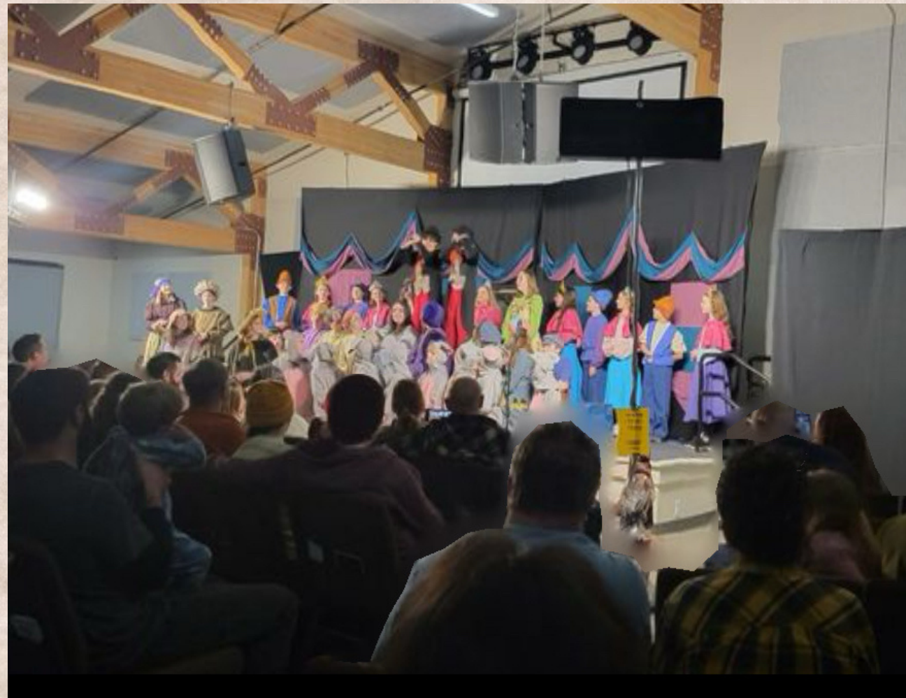
Post-performance cast picture.